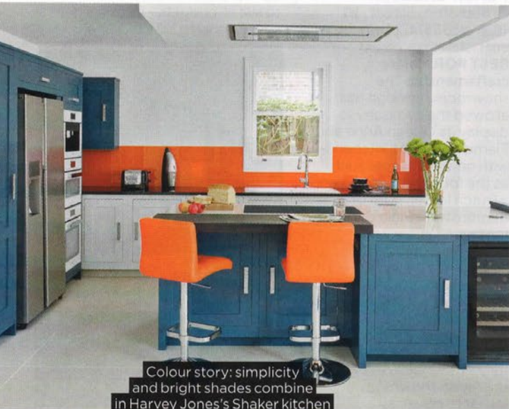
Colour story: simplicity and bright shades combine in Harvey Jones's Shaker kitchen

78-80 Wigmore Street, W1 (020 7486 8711, magnet.co.uk), plus branches across London and the Southeast BEST FOR Space-saving ideas A no-brainer for broad choice and design flexibility