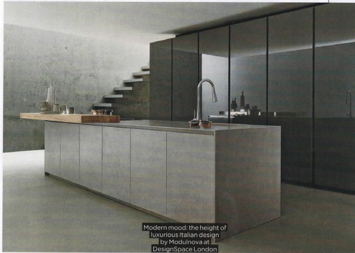
Modern mood: the height of luxurious Italian design by Modulnova at DesignSpace London

25 Chepstow Corner, W2 (020 7792 5333, harveyjones.com),