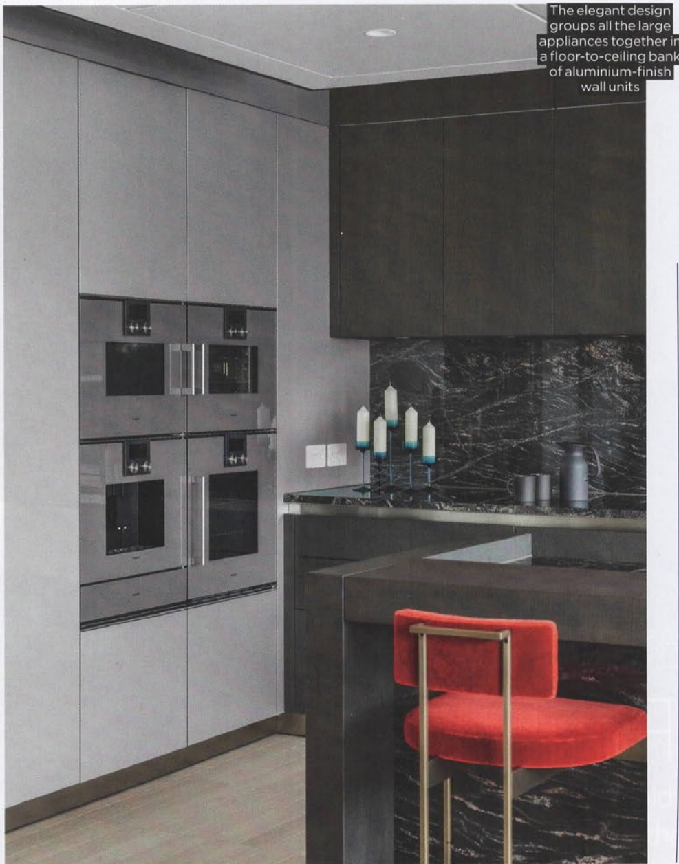
The elegant design groups all the large appliances together in a floor-to-ceiling bank of aluminium-finish wall units