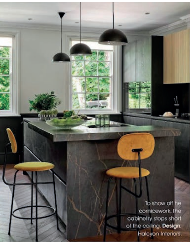
To show off the cornice work, the cabinetry stops short of the ceiling. Design. Halcyon Interiors.