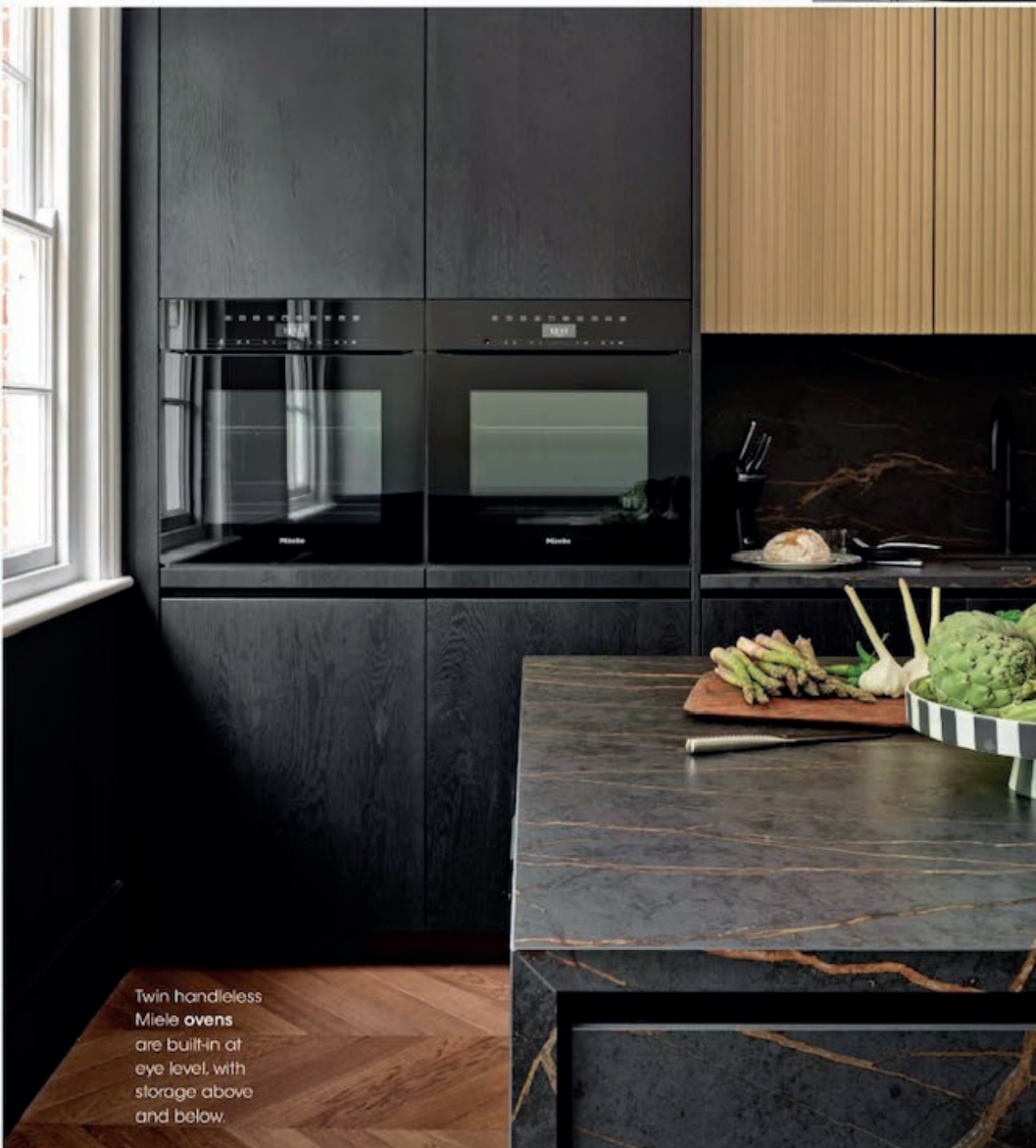
Twin handleless Miele ovens are built-in at eye level, with storage above and below.