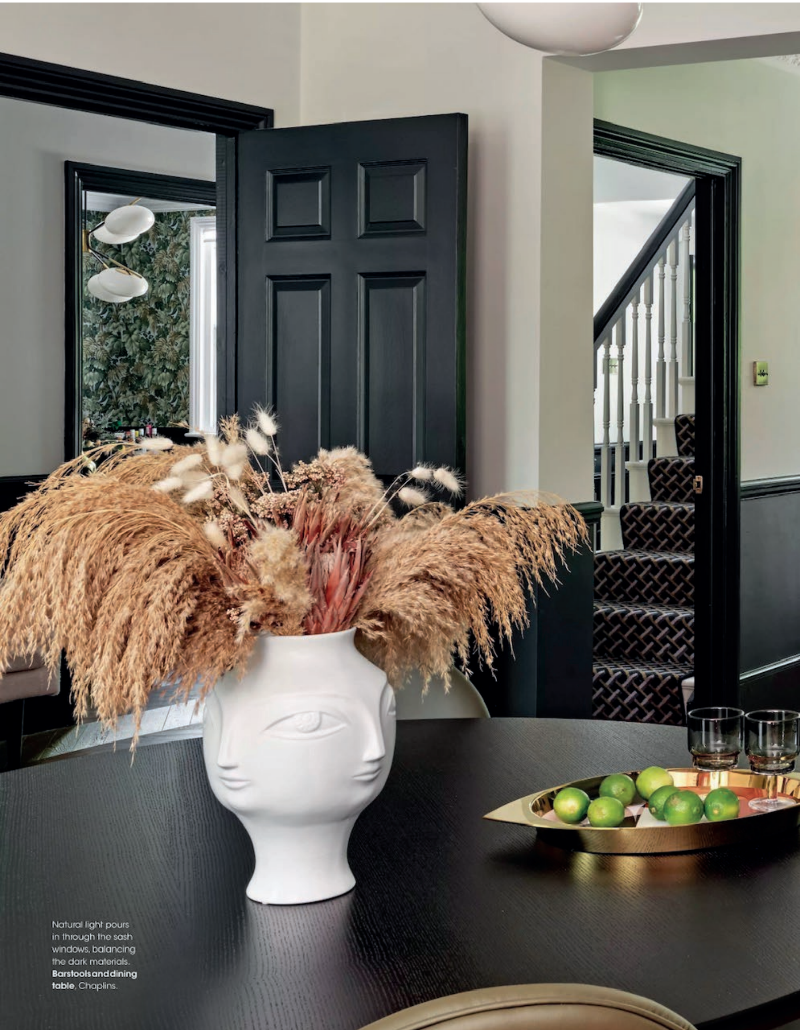
Natural light pours in through the sash windows, balancing the dark materials. Barstools and dining table , Chaplins.