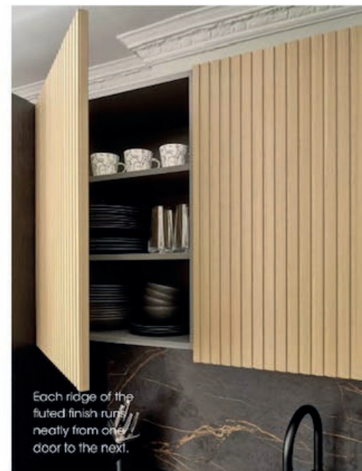
Each ridge of the fluted finish runs neatly from one door to the next.