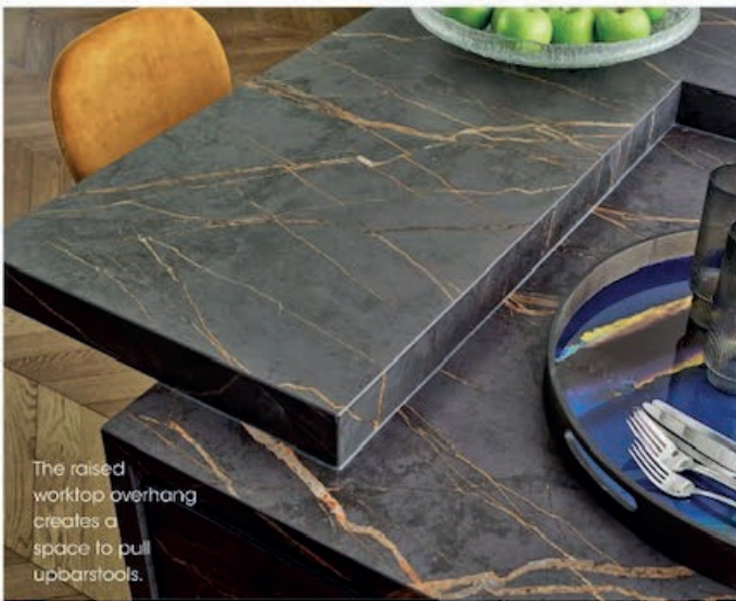
The raised worktop overhang creates a space to pull up bar stools.