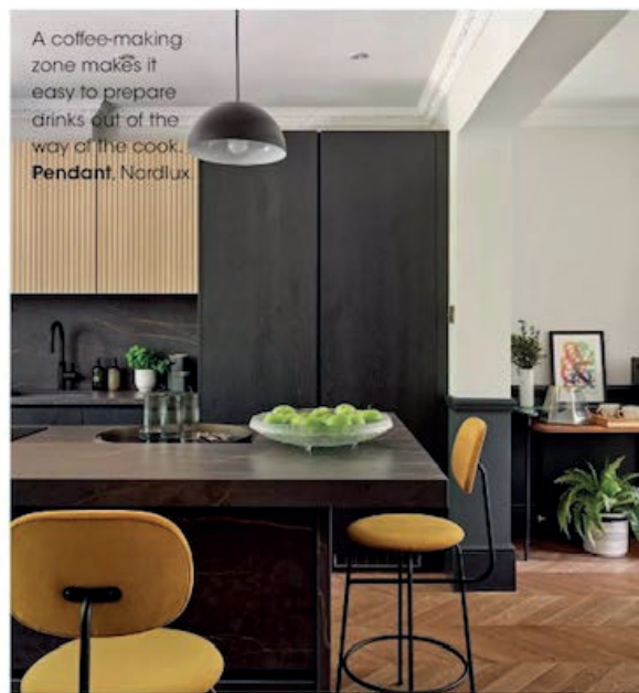
A coffee-making zone makes it easy to prepare drinks out of the way of the cook. Pendant. Nordlux.