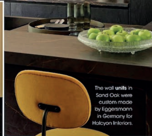
The wall units in Sand Oak were custom made by Eggersmann in Germany for Halcyon Interiors.