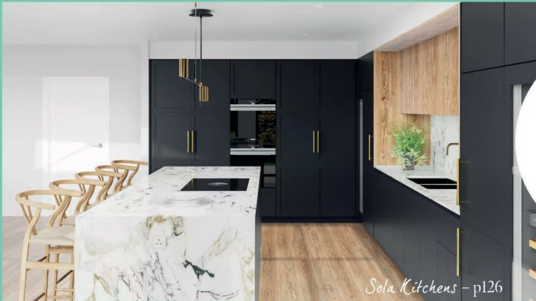
Sola Kitchens – p126