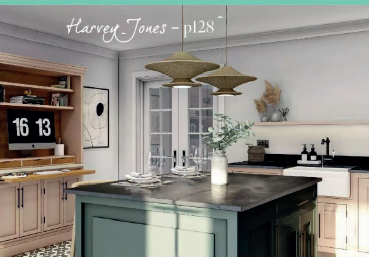
Harvey Jones – p128