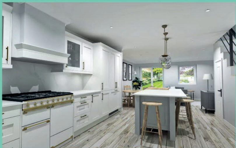
Sheraton Interiors – p130