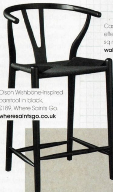
Olson Wishbone-inspired barstool in black, £189, Where Saints Go. wheresaintsgo.co.uk