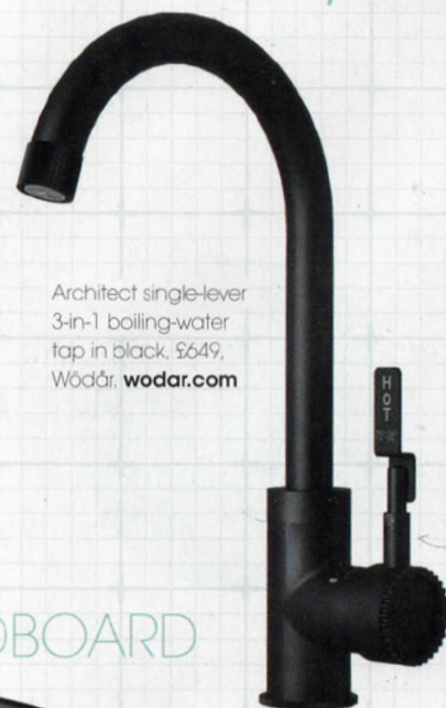
Architect single-lever 3-in-1 boiling-water tap in black, £649, Wödär. wodar.com