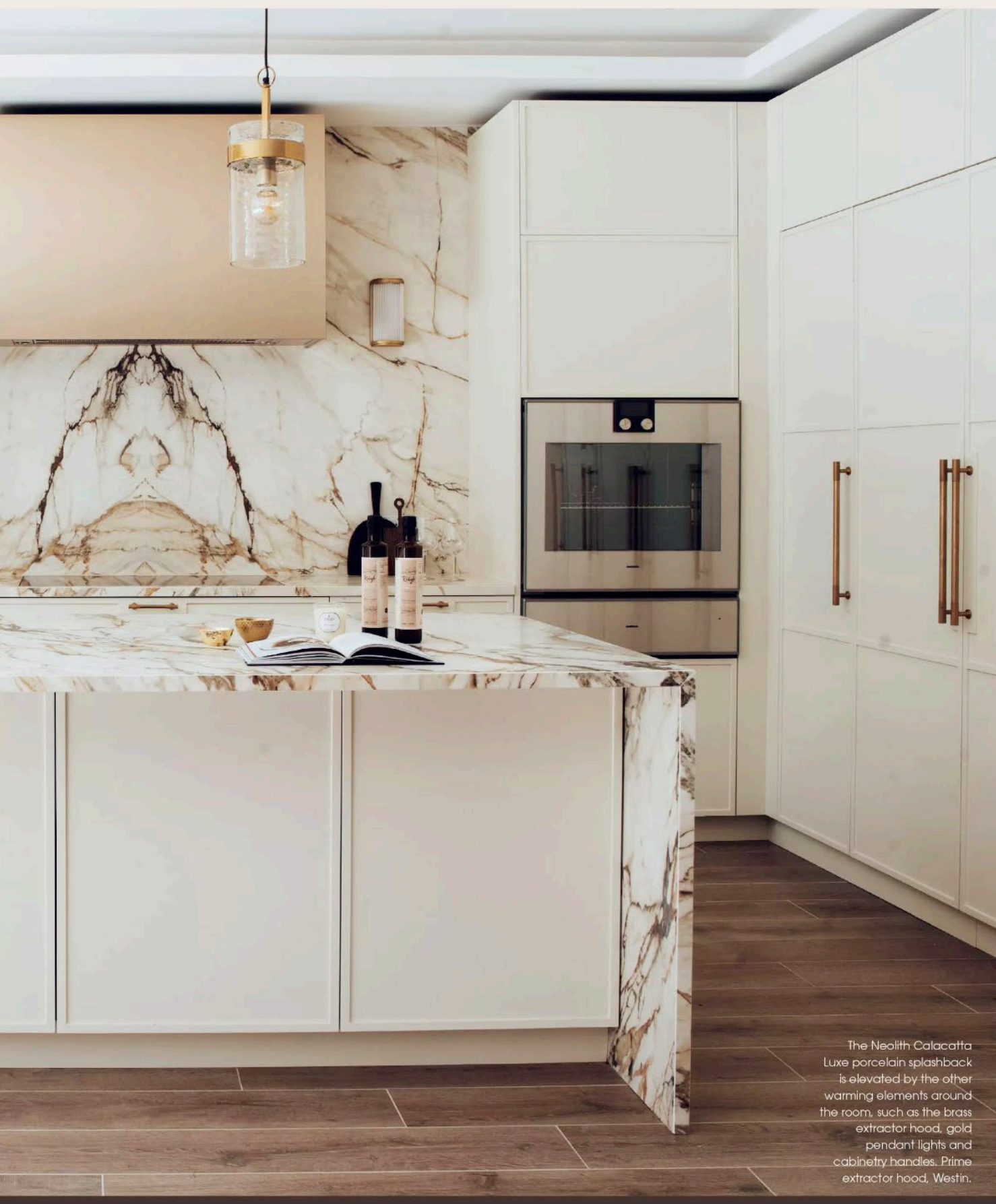
The Neolith Calacatta Luxe porcelain splashback is elevated by the other warming elements around the room, such as the brass extractor hood, gold pendant lights and cabinetry handles. Prime extractor hood, Westin.