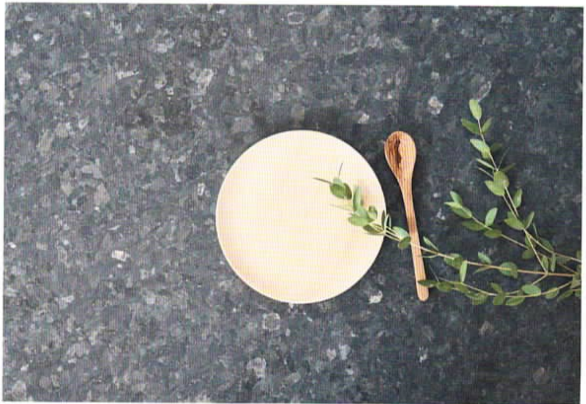
Emerald worktop, from £680 per sq. m, Lundhs

Lasts a lifetime In an alluring deep tone, Lundhs Emerald is one of the darkest tones in the collection and is a classic choice. "The intense colour paves a particularly intriguing character in your kitchen," say Lundhs. This surface will complement metallic accents as well as wood tones. Its qualities as a natural stone also ensure it is easy to clean and maintain, as well as being water resistant.