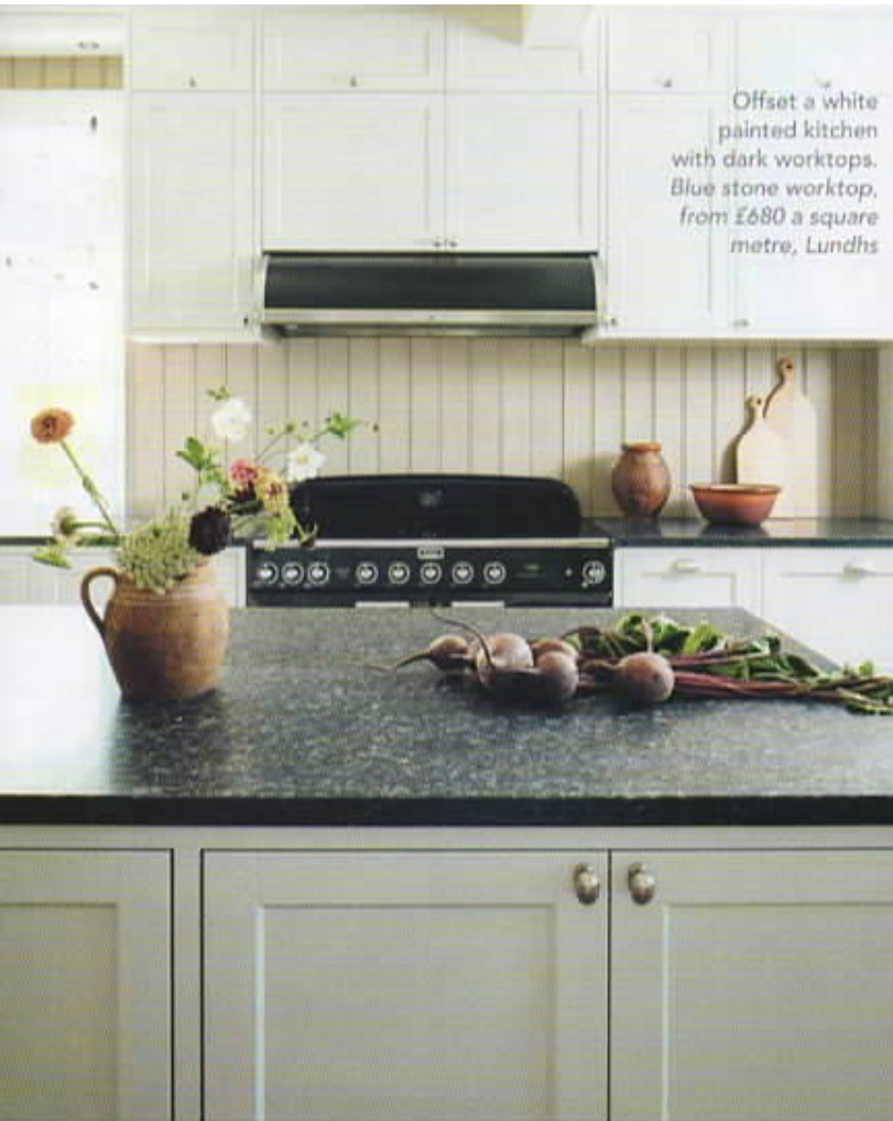
Offset a white painted kitchen with dark worktops. Blue stone worktop, from £680 a square metre, Lundhs