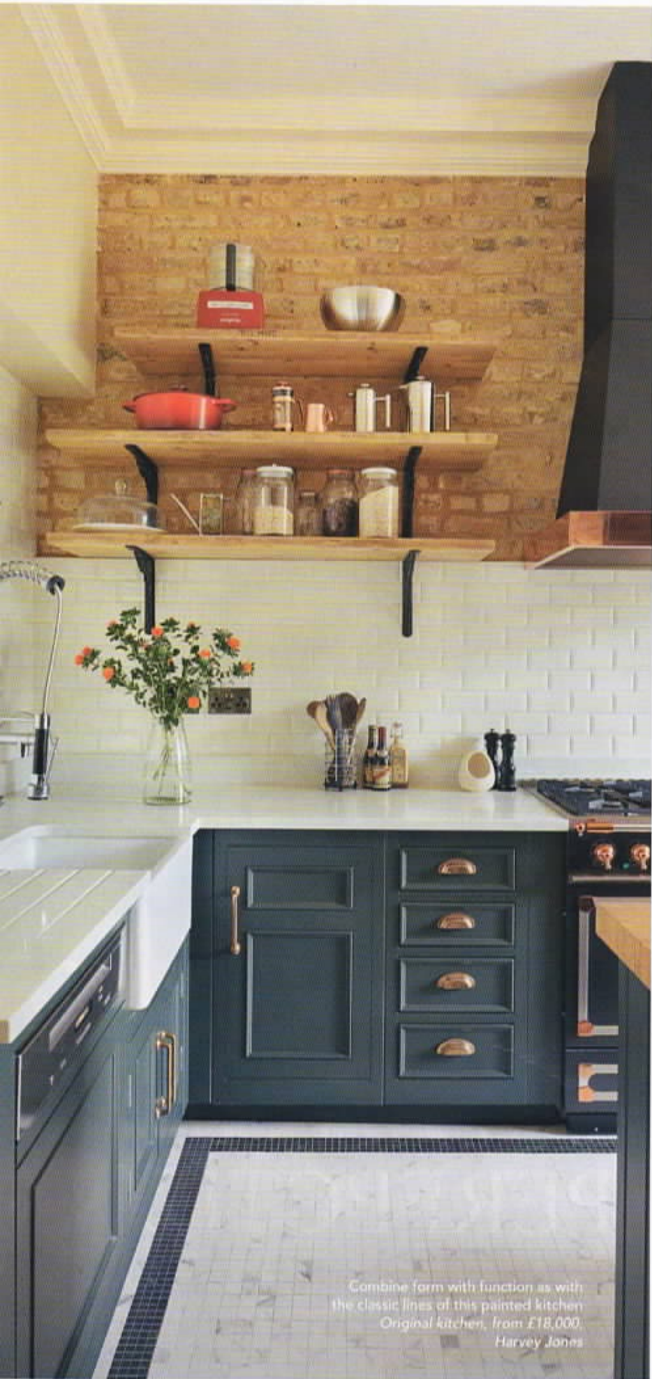
Combine form with function as with the classic lines of this painted kitchen Original kitchen, from £18,000. Harvey Jones