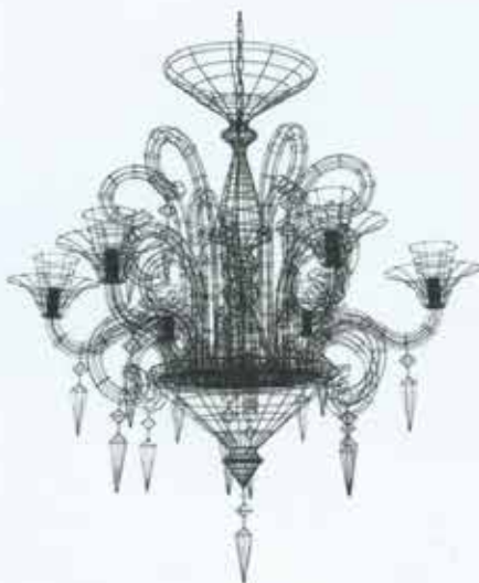
Make a statement with lighting. Angelus Shadow Black Wire chandelier , H115x85cm diameter, £1,450, Rockett St George.