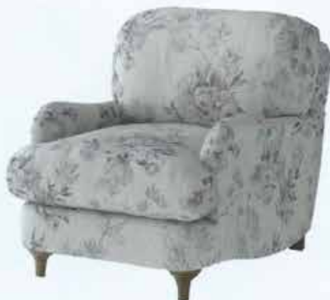
Sit down in comfort. Jonesy armchair in Dusty Blue Vintage Rose, H73xW79xD99cm, £1,095, Loaf.