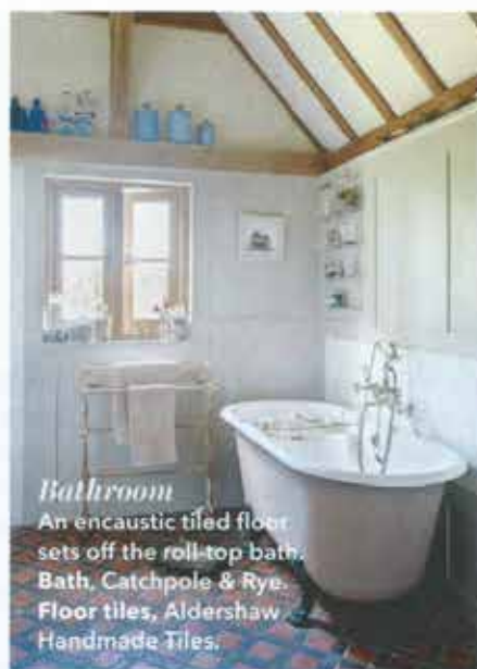
Bathroom An encaustic tiled floor sets off the roll-top bath. Bath, Catchpole & Rye. Floor tiles, Aldershaw Handmade Tiles.