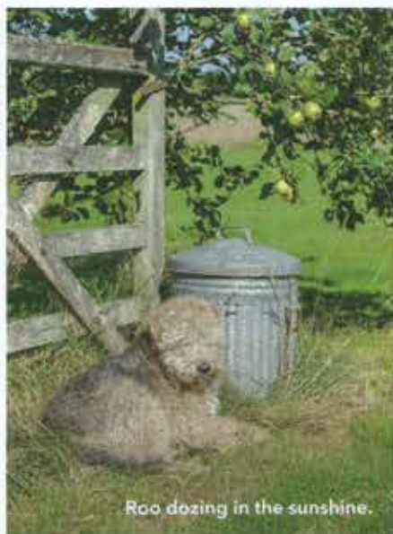
Roo dozing in the sunshine.

What makes this house a home... 'It's busy, quirky and reflective of everyone's personalities. It's big enough to find peace and quiet, but also small enough to bring us all together'