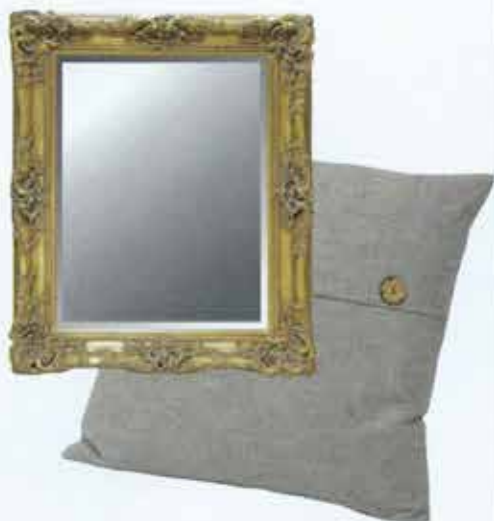
Don't forget the finishing touches. Decorative wall mirror , H130xW106cm, col Gold, £310, Out There Interiors. Button-flap cushion , 45cm sq, £11, Brand Interiors.