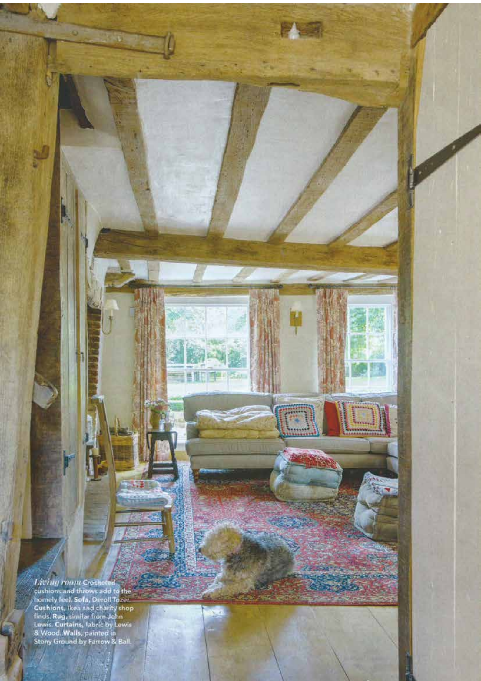
Living room Crocheted cushions and throws add to the homely feel. Sofa , Derroll Tozer. Cushions , Ikea and charity shop finds. Rug , similar from John Lewis. Curtains , fabric by Lewis & Wood. Walls , painted in Stony Ground by Farrow & Ball.