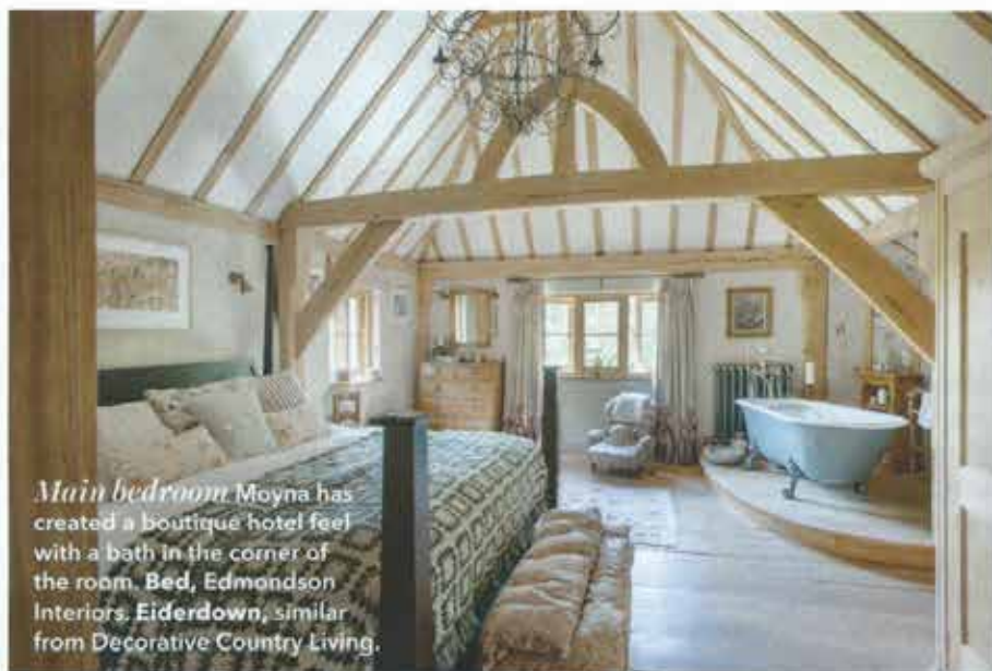
Main bedroom Moyna has created a boutique hotel feel with a bath in the corner of the room. Bed, Edmondson Interiors. Eiderdown, similar from Decorative Country Living.