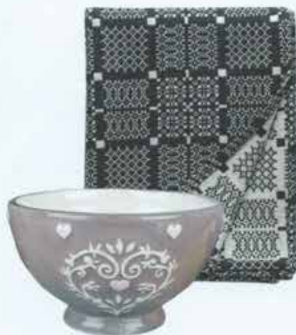
Bring in pattern. French Grey Love Heart breakfast bowl , H10.5cm, £7, Dibor. Knot garden throw , 180x150cm, col Graphite, £145, Melin Tregwynt.

For more ideas go to housetohome.co.uk/countryhomesandinteriors