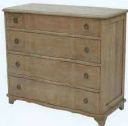
Catch the eye with curvy styling. Arles chest of drawers , H96xW110xD50cm, £695, Within Home.

For more ideas go to housetohome.co.uk/countryhomesandinteriors